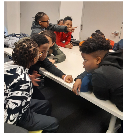
Explorers work together to answer Black History Month Jeopardy questions.

Explorers and Juniors played a special Clubhouse version of Jeopardy: Black History Month. With prompts including: "He was the home run king (estimated 962 home runs) and catcher who never made it to the MLB" and "She started a space camp for children after being the first African American female to fly in space," the game was an exciting way to learn about the legacy of important individuals. **And, if you don't know the answer to these prompts or the names listed above, we encourage you to do some research to better educate yourself on the countless individuals and groups who fought and continue to fight for equality. By doing so, you'll join us in supporting our Clubhouse members through the immense power of knowledge and personal empowerment.