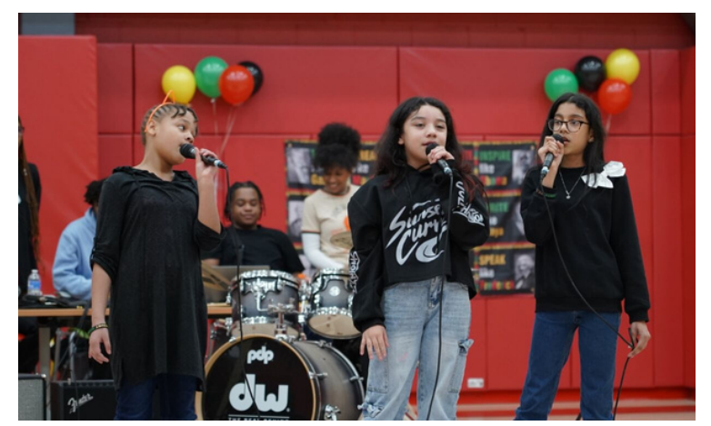
Junior members perform "Lift Every Voice" at the showcase.

We invite you to join us this month and every month as we honor Black history and celebrate the incredible achievements of Black, Brown and Indigenous individuals and communities in New York City and beyond. Together, with your support, we will continue to create a future where every young person is empowered to stand up for themselves and to reach their full potential.