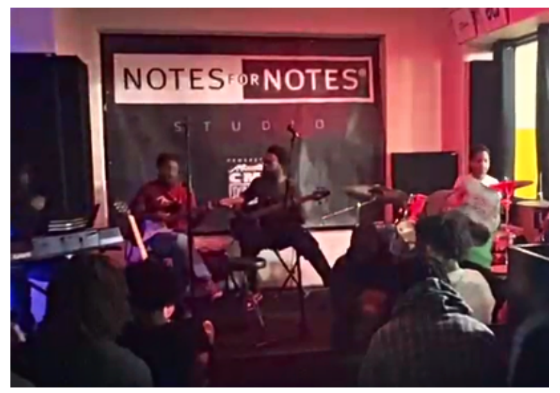
Members perform songs, spoken word and more in the music studios celebrating Black History Month.